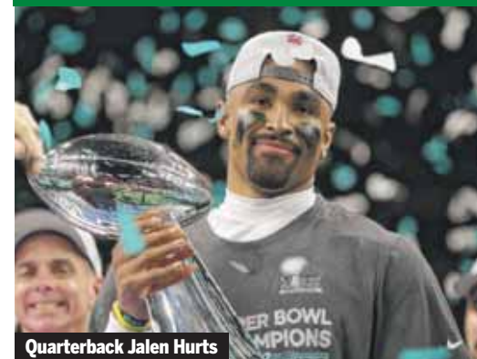
Quarterback Jalen Hurts